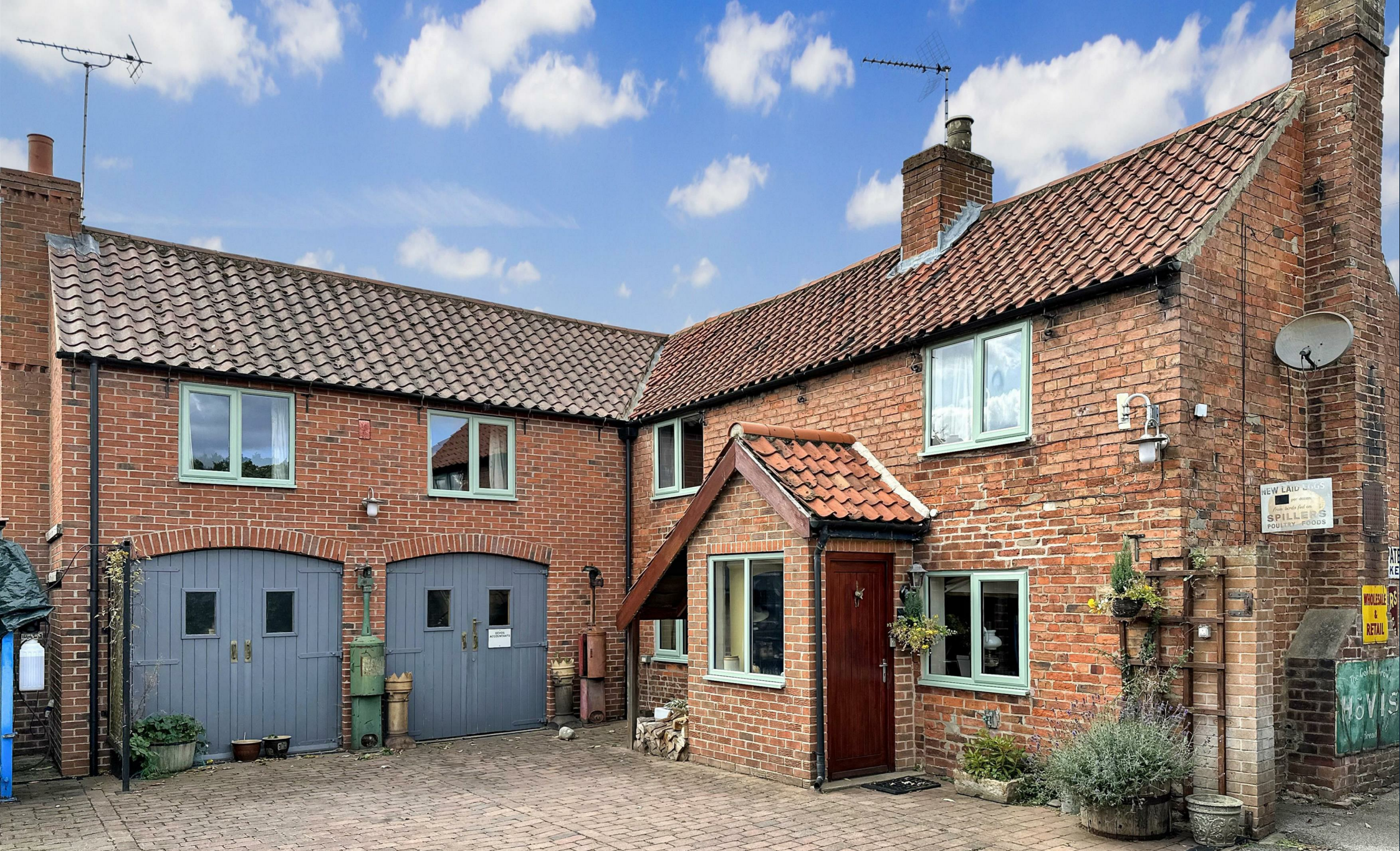
Bramley Cottage, Church Lane, Besthorpe, Newark